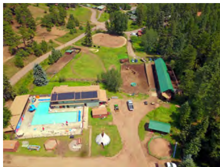
Pool and Stables