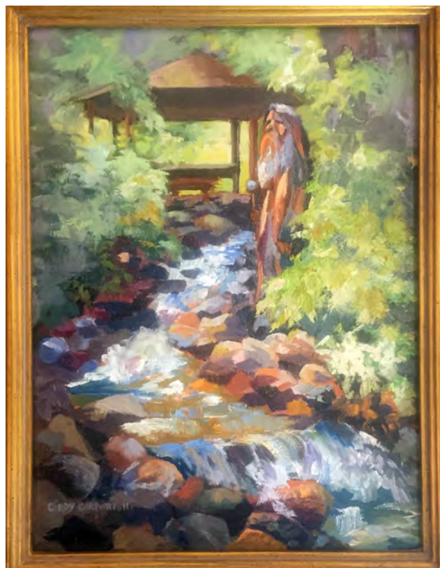
Portrait of Merlin's Spring