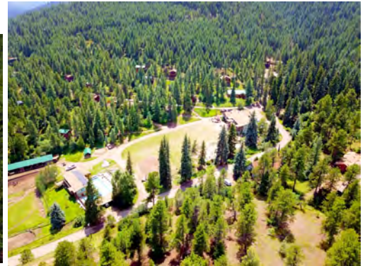
Meadow, Girls Hill