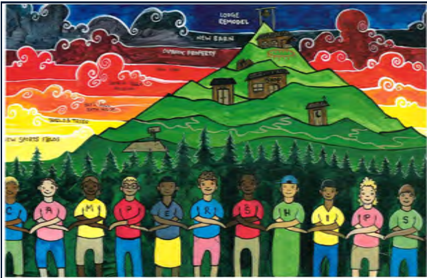
Centennial Vision Quilt

WELCOME to Geneva Glen’s 95th birthday where reverie and singing is still echoing from the old towering trees encircling the Council Ring!! If you missed this one, then you will just have to wait until the Centennial in 2022! One thing seems certain: we will be ready! Attendance records were broken, and the photo above reveals the close and cozy atmosphere, as 675 bodies made new friends, but kept the old! The Labor Day weekend, 2017, will be long remembered as it was perfect in the outdoors, in early Colorado autumn weather, colorful, warm, and inviting. Enjoy the view from the newly acquired “drone” camera below which presents a new and fascinating perspective of the entire camp site, allowing us to continue to elevate our view with each new improvement.