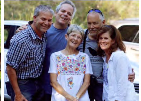
“One is silver, the other gold!” Friendships that last forever were abundant!